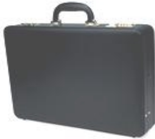
WBS-1204 Briefcase Spy Camera